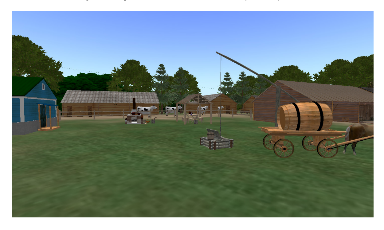
Figure 5. Visualization of the yard model in Vernadskiy's family estate.