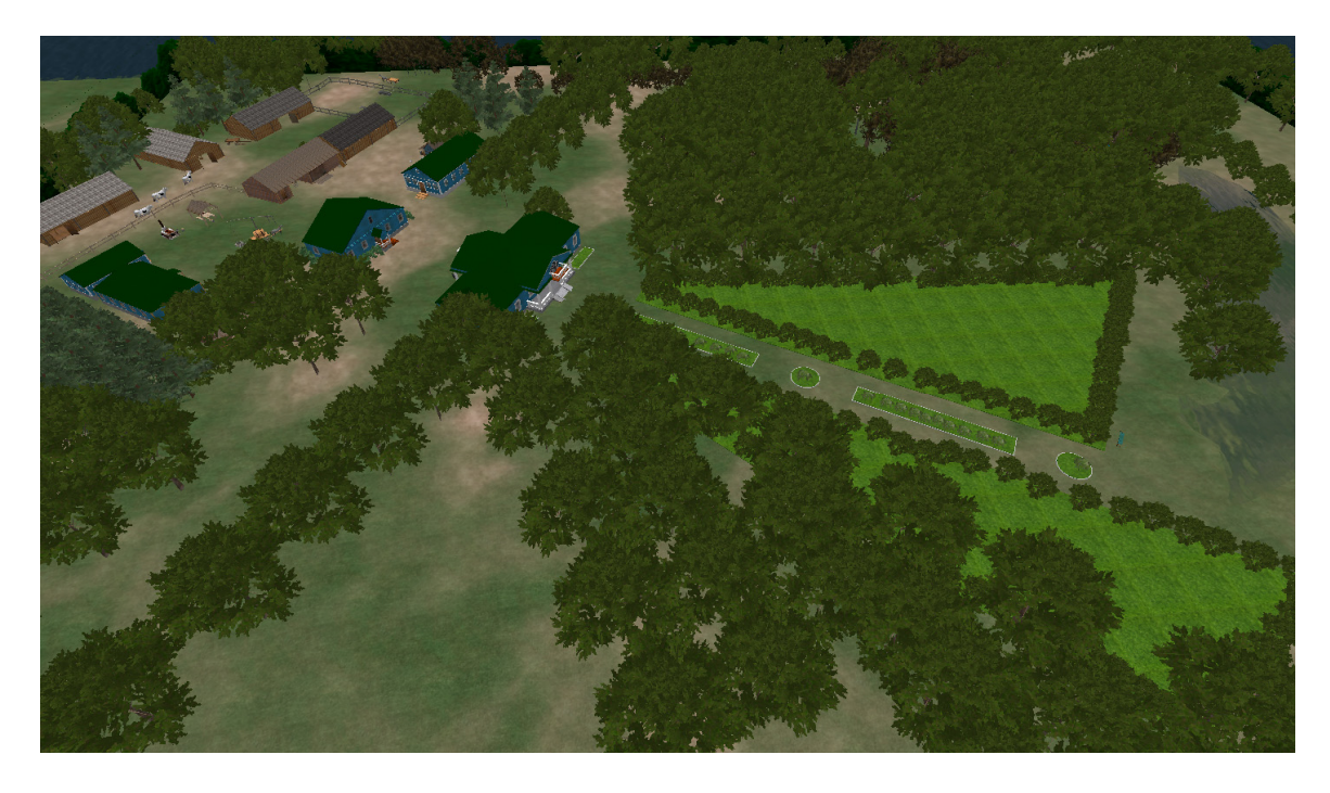
Figure 3. General view of the model of Vernadsky's family estate.