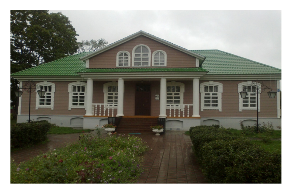
Figure 1. Reconstructed house-museum of V I Vernadskiy.

1553 (2020) 012022 doi:10.1088/1742-6596/1553/1/012022